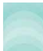
Wallpaper Cool Noon 0,53 x 10 m 29,95 Euro