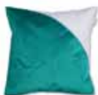
Cushion Corro 2 colors available 38 x 38 cm 22,99 Euro