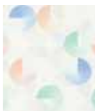
Wallpaper Morning Blush 0,53 x 10 m 41,95 Euro