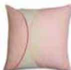
Cushion Tavai 2 colors available 45 x 45 cm 22,99 Euro