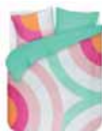
Bed linen Kio 100% cotton/sateen e.g. 79,95 Euro