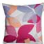
Cushion Aleza 2 colors available 45 x 45 cm 19,99 Euro