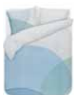
Bed linen Tavai 100% cotton/sateen e.g. 69,95 Euro