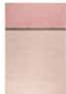
Calippo Kelim 3 sizes available e.g. 80 x 150 cm 129,00 Euro