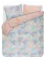
Bed linen Heras 2 colors available 100% cotton/sateen e.g. 69,95 Euro