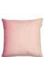
Cushion Punti 2 colors available 38 x 38 cm 19,99 Euro