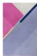
Carpet Xaz 6 sizes available e.g. 70 x 140 cm 159,00 Euro