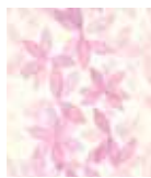
Wallpaper Cool Noon 0,53 x 10 m 29,95 Euro