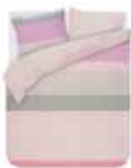
Bed linen Makon 2 colors available 100% cotton/percale e.g. 49,95 Euro