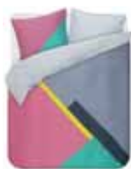
Bed linen Xaz 100% cotton/sateen e.g. 79,95 Euro